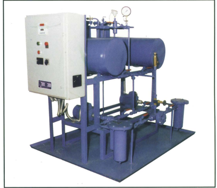
FURNACE OIL HEATING PUMPING FILTERING UNIT