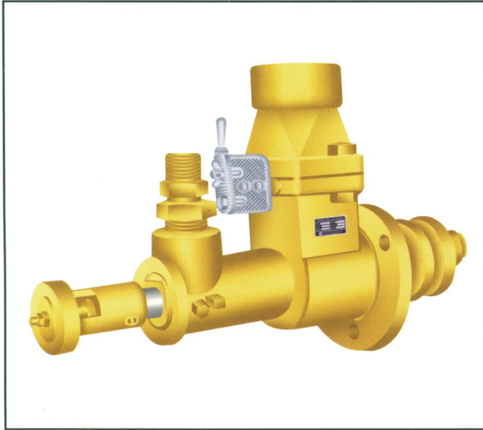
LOW AIR PRESSURE OIL/GAS/DUAL FUEL BURNERS