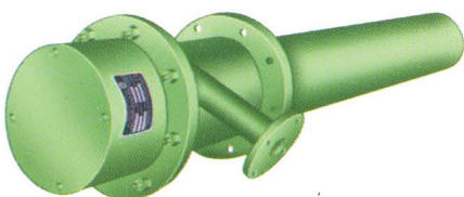
FURNACE OIL OUT FLOW HEATER