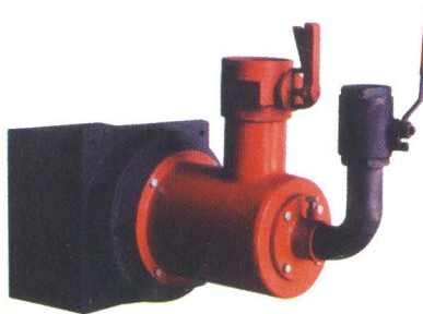
HIGH TEMPRATURE GAS BURNER